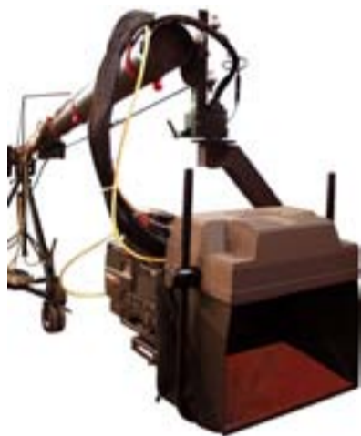
QTV FDP-II Prompter on Jib Arm