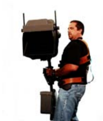
QTV FDP-II Prompter mounted on Steadicam® universal mount